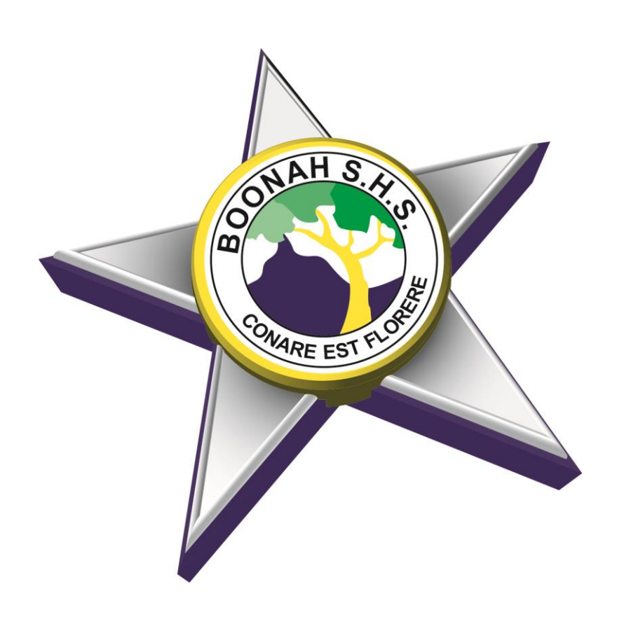
Version 1.2, 2022 VET Student Handbook